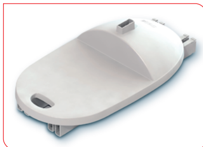
Integrated handle and secure catches on all individual parts for transport ease.