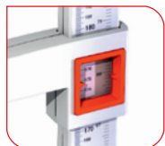
Two large windows and double-sided scale for easy readout.